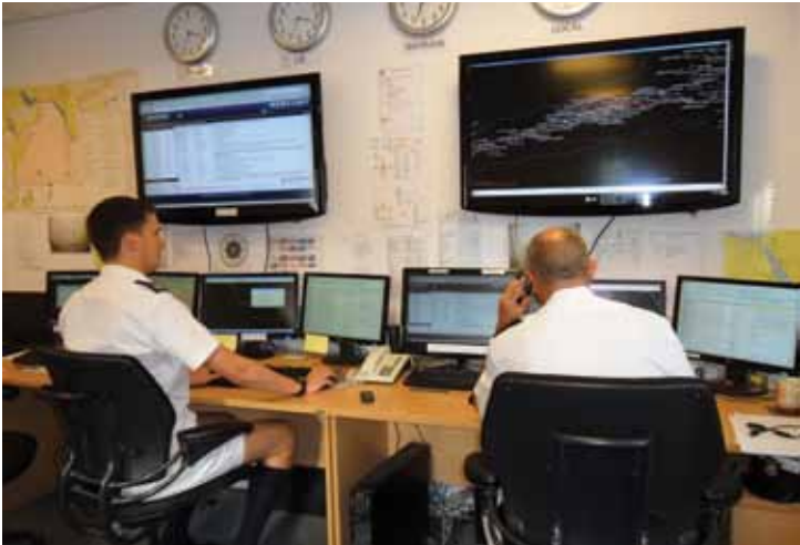
Operations room UKMTO

It is important that vessels and their operators complete both the UKMTO Vessel Position Reporting Forms and register with MSCHOA